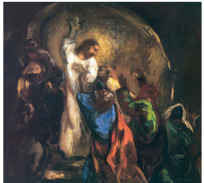
Thomas touches Jesus' side