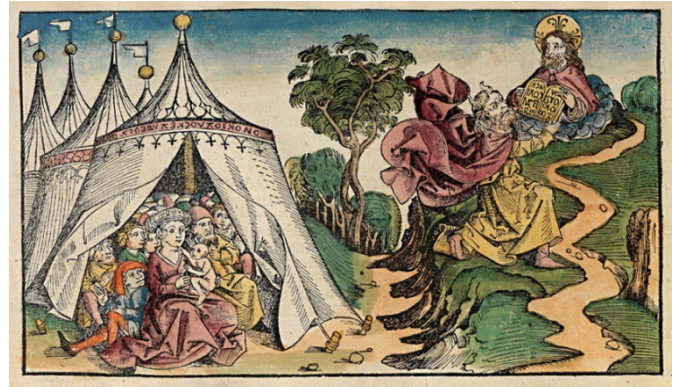
Moses receiving the law From the Nuremberg Chronicle, 1493