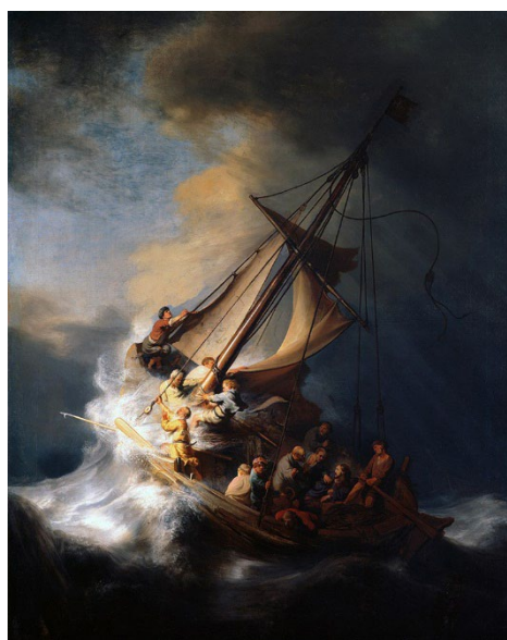
Storm on the Sea of Galilee Rembrandt Harmenszoon van Rijn, 1606-1669

1 The Lord is king, he is robed in majesty; the Lord is robed, he is girded with strength. He has established the world; it shall never be moved; 2 your throne is established from of old; you are from everlasting. 3 The floods have lifted up, O Lord, the floods have lifted up their voice; the floods lift up their roaring. 4 More majestic than the thunders of mighty waters, more majestic than the waves of the sea, majestic on high is the Lord! 5 Your decrees are very sure; holiness befits your house, O Lord, for evermore.