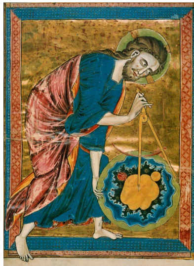
God as Architect, Builder, Geometer & Craftsman

The Frontispiece of Bible Moralisée ca. 1250 Österreichische Nationalbibliothek Vienna